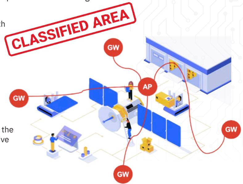
GW - Gateway / AP - Access Point